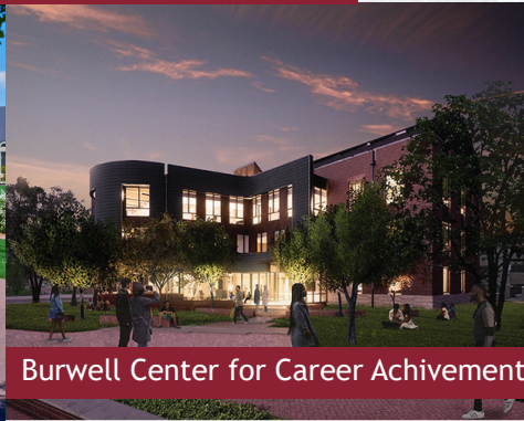
Burwell Center for Career Achievement

Sturm Hall is home to the College of Arts, Humanities and Social Sciences. While being a major research university, we have a liberal arts philosophy at our core, and work to ensure that all graduates are exceptional writers, have strong quantitative reasoning skills, and are able to excel in a number of fields.