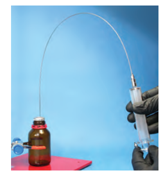
Fig. 9 Removing gas bubbles and returning excess reagent to the Sure/Seal bottle