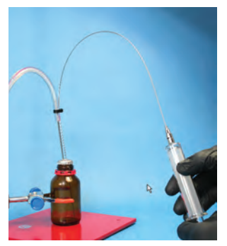
Fig. 8 Filling syringe using nitrogen pressure