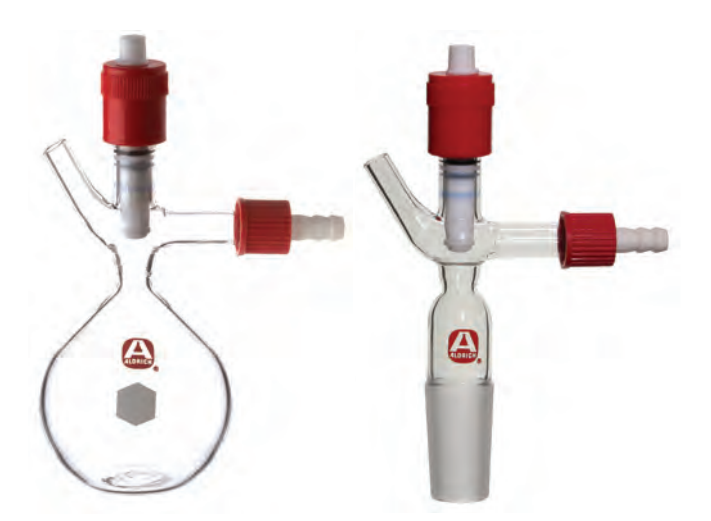
Fig. 14 Aldrich Sure/Stor™ flask