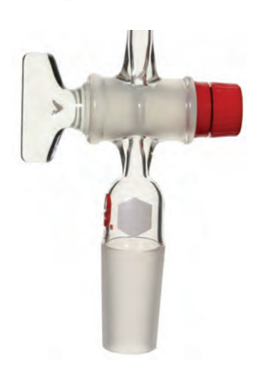
Fig. 5 Septum inlet adapter