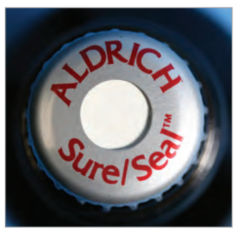
Fig. 1 Crown cap with hole

The polypropylene cap on a Sure/Seal bottle can be safely removed because the crown cap and liner are already crimped in place. The reagent can then be dispensed using a syringe or double-tipped needle inserted through the hole in the metal cap ( Fig.1 ). We recommend only smallgauge needles (no larger than 18-gauge) be used and the polypropylene cap be